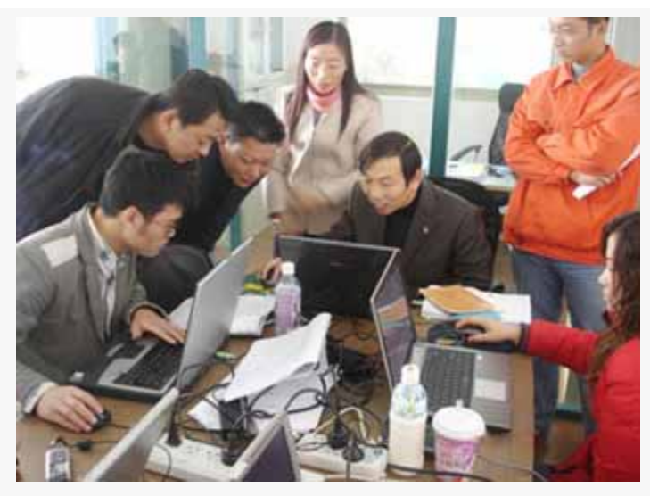
Drawing and Design Training