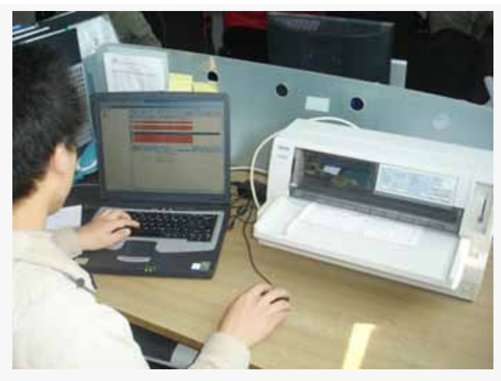
Drawing and Design Training