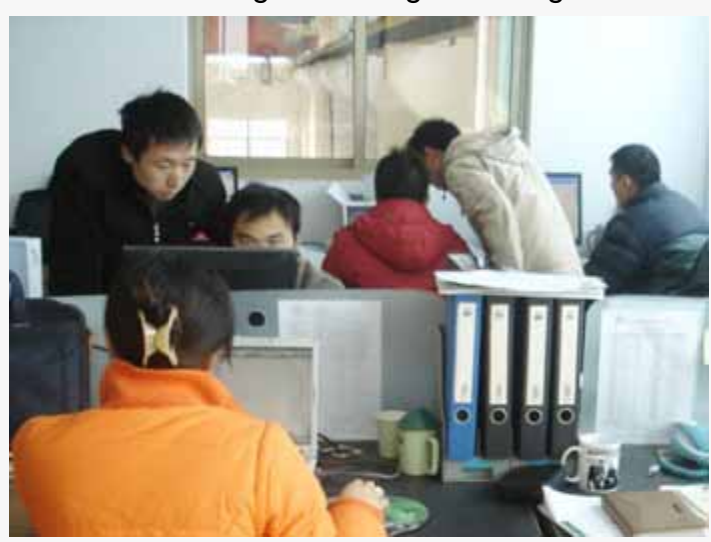
Drawing and Design Training